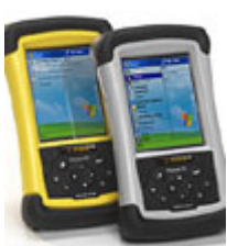
WIN CE Handheld